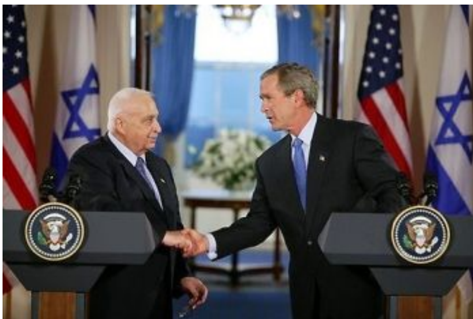
The second Beast at the service of the first

A bit further, in the same chapter, I read that there is a “ second Beast ... servant to the first Beast, and extended its authority everywhere, making the world and all its people worship the first beast, which had had the fatal wound and had been healed... and none could buy or sell anything unless he had been branded with the name of the beast” (Revelation 13,11-17). I deduced then that the first Beast being Israel, the second Beast that supports it cannot be but the U.S.A. who protects and arms Israel. I better understood who were these “enemies that I would draw to myself”, and who were the “many peoples, nations, languages and kings against whom I will have to prophesy again ”, since the testimony against Israel today, is no longer practiced as the prophets and Jesus did in the past (for example Isaiah 1,2-4 / Jeremiah 2,26-37 / Micah 3,9-12 / Matthew 23,33-37 / John 8,44).