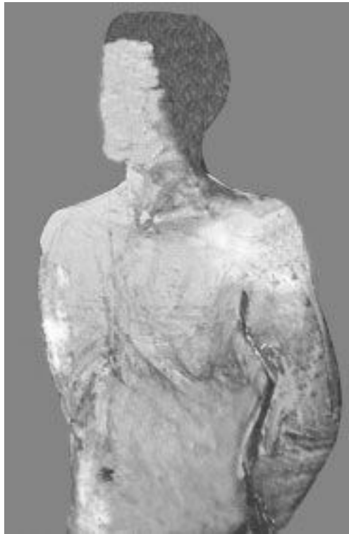
Vision of Jesus

On May 13, 1970, Jesus revealed, ultimately, the proclaimed secret in the following way: at dawn, as I'm waking up, I see Him like a man of Light sculptured from a radiant, white marble stone, standing at my bedside. A profound peace, an assurance, and an invincible power emanated from Him.